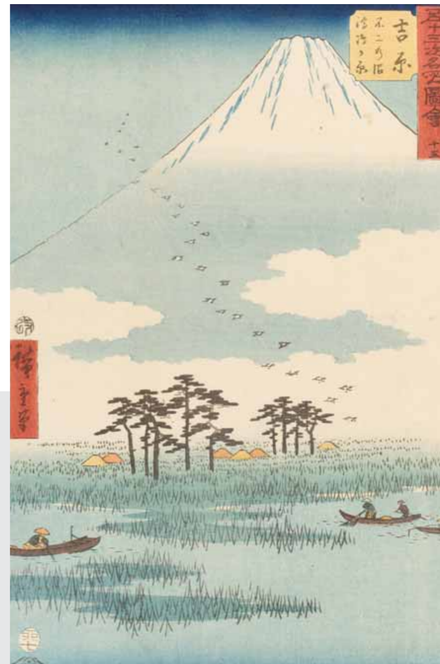
Famous Sights of the Fifty-three Stations "Yoshiwara: Floating Islands in Fuji Marsh"

Artist: Utagawa Hiroshige (Japanese, Tokyo (Edo) 1797-1858 Tokyo (Edo))