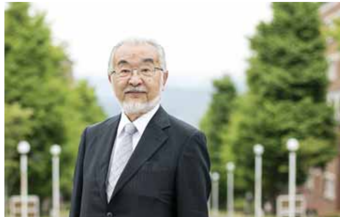
Chairman of the Board of Directors, Shizuoka Prefectural University Corporation