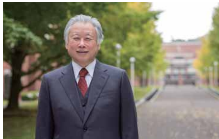
President of the University of Shizuoka